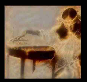
An Ode To Transhumanism