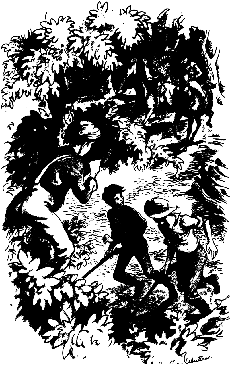
Buck Grangerford and his cousin pursued by the Shepherds.