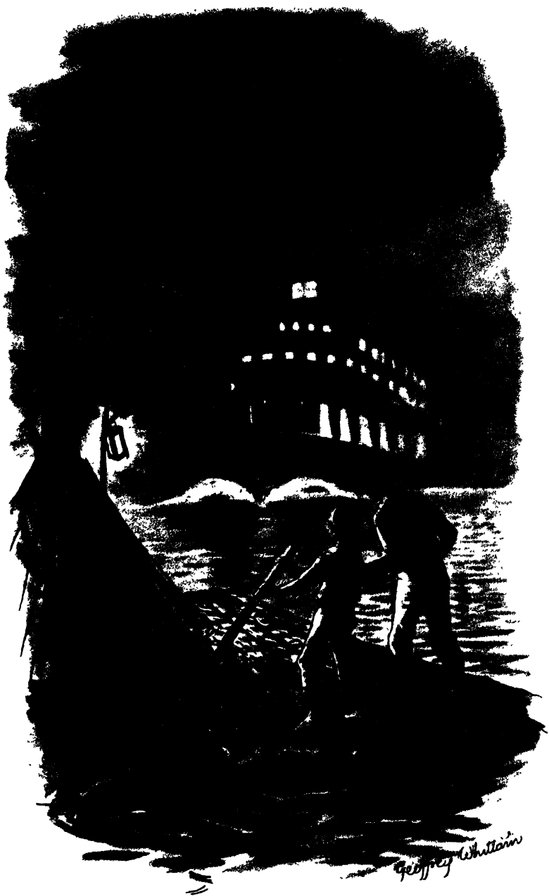
Huck and Jim see the steamboat coming up the river.