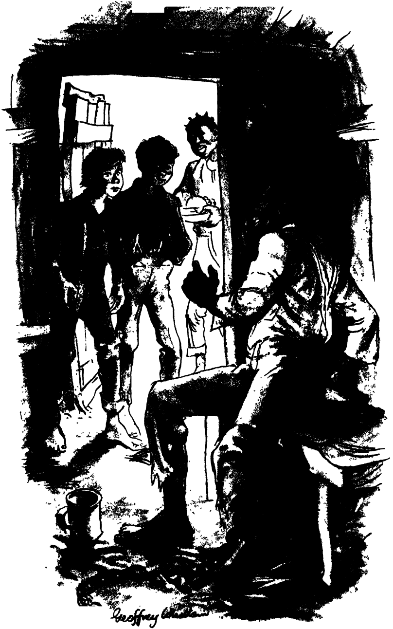
Huck and Tom Sawyer discover Jim's hiding-place.