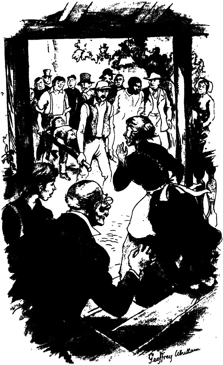
Tom is brought to Aunt Sally's on a stretcher.