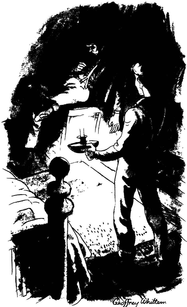
Huck finds Pap in his room.