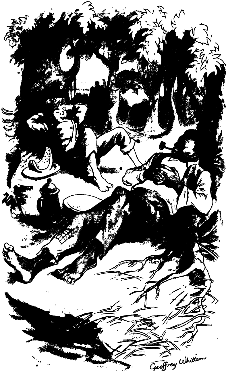
Huck and Jim on Jackson's Island.