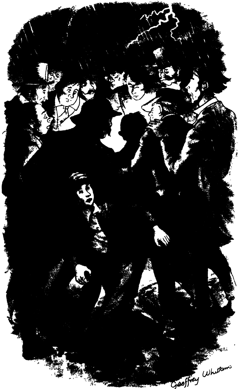
Huck escapes from the crowd at Wilks' grave.